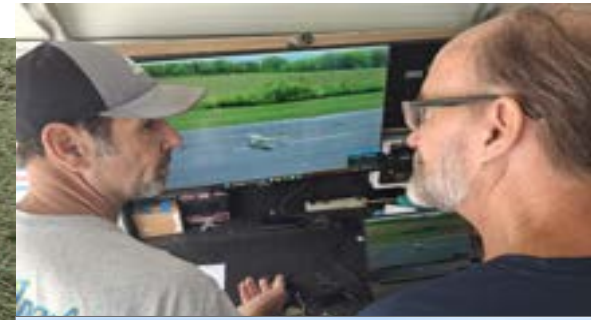
Learning on the simulator