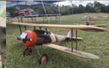
Quite a turn out!