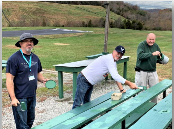
Don't you just love to see happy people at work? Thanks guys...