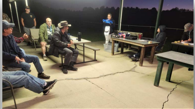
You can see how fast it got dark...