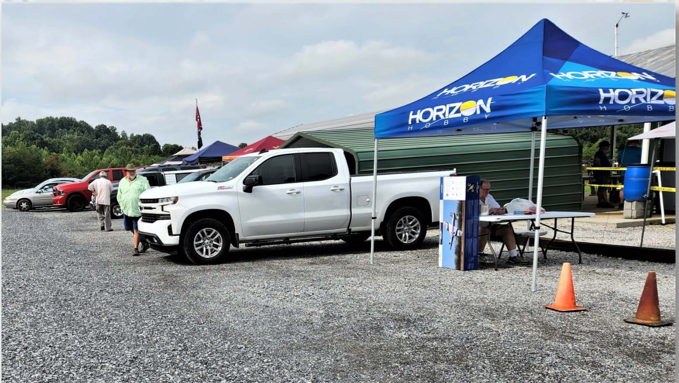
Let's not forget our long-time friend and sponsor. Bob's HobbyTown USA of Johnson City is a Horizon Hobby outlet and much more. Don't forget our 10 percent of retail cub discount!