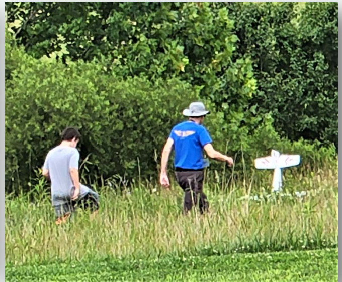
Oh, the agony of da feet. Aircraft recovery is also part of the hobby.