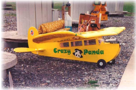
1 . Some are smaller.