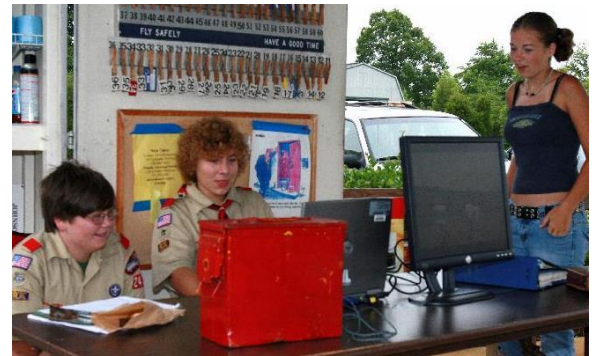
Everyone helping out.