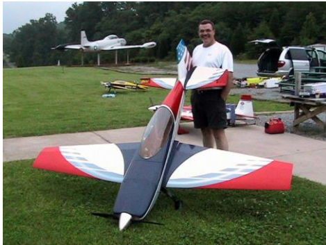
2 . Some are larger.