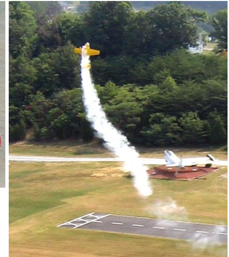
Acrobatic plane with smoke. Note, this photo was taken from another remote controlled airplane.