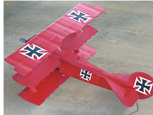
A homemade scale WWI German Fokker tri-plane. Made of foam.