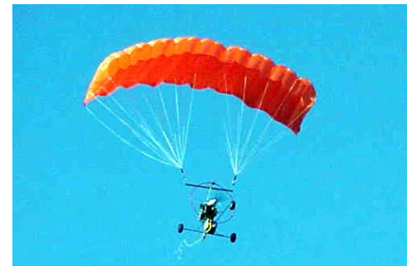
Parasail aircraft in flight.