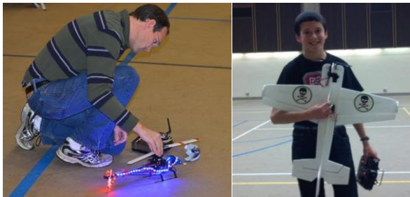
3 . Some fly indoors.