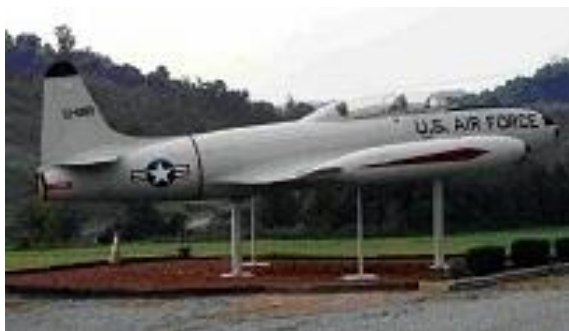
Our U.S. Air Force T-33 aircraft , on display. Come out and learn its history.