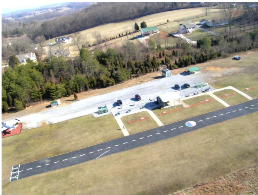
Aerial view of Bowser Ridge Model Airport taken from one of our aircraft.