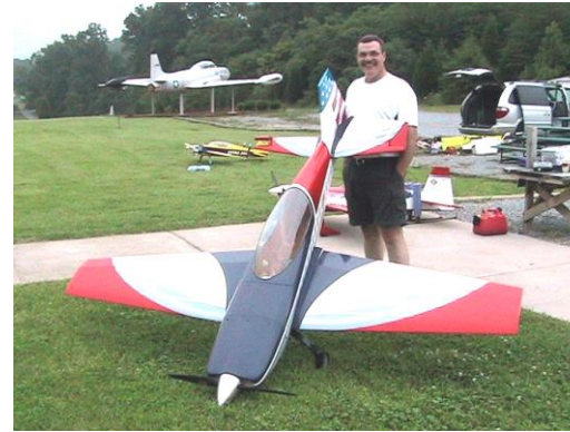
Large acrobatic airplane.