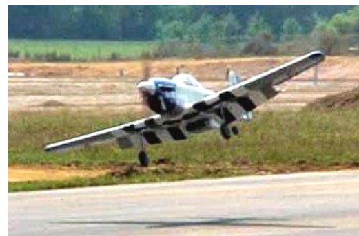
A P-51 Mustang (WW II scale airplane) making a beautiful landing.