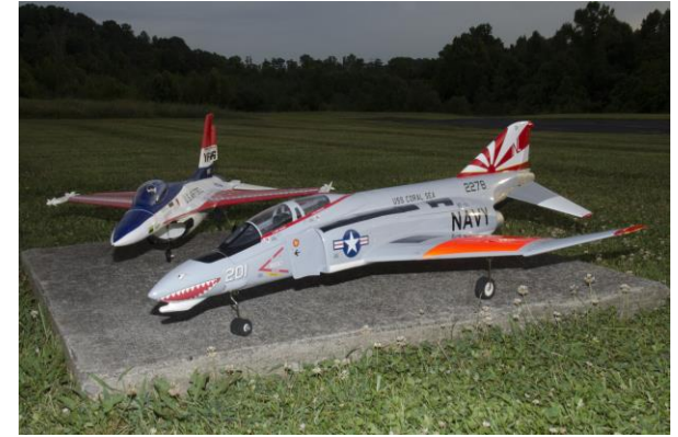
Yep. Cool jets too!