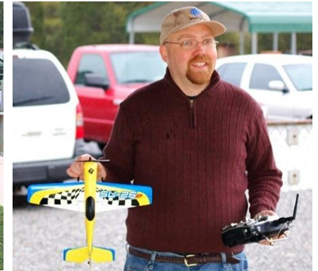
Small acrobatic airplane.