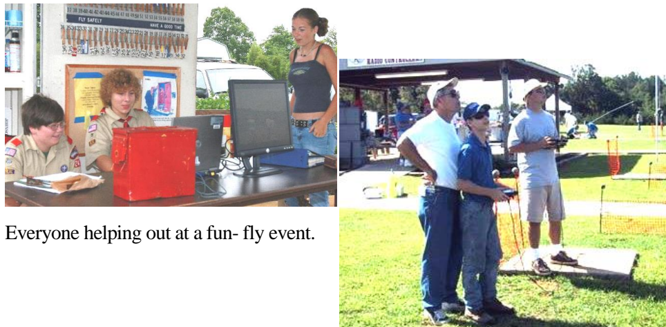
Everyone helping out at a fun-fly event.

Depends on how good you want to get – like anything else, right? Usually from a week or two for a simple trainer to several years. Most Most all of us are still learning!