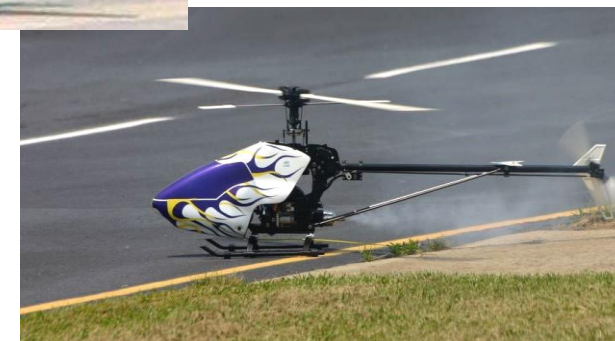
A helicopter preparing to take-off.